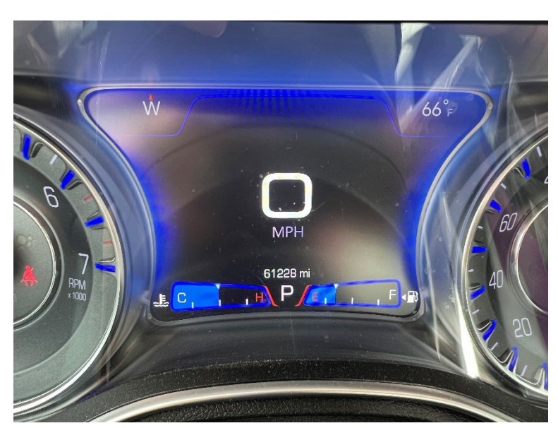
2019 Chrysler 300 Limited AWD 3.6L V6 Engine

TorqueFlite 8 speed Automatic Transmission