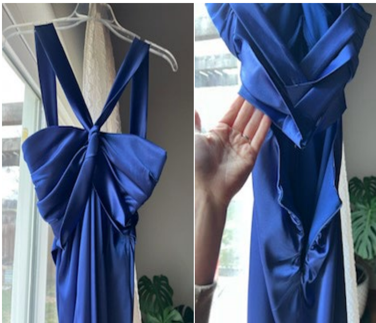
Prom Dress $40 Text 509-205-4794