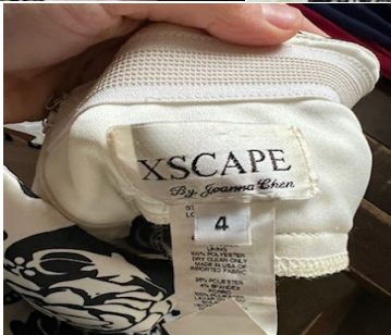
Prom Dress $40 Text 509-205-4794