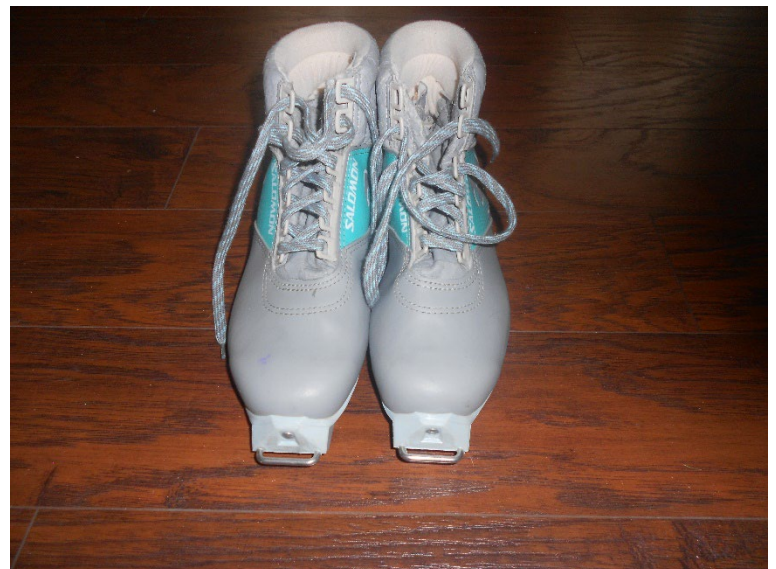
Salomon SR 301 Nordic Cross Country Ski Boots Size EU 40 (Ladies Sz 7) $25 Text 253-221-1215