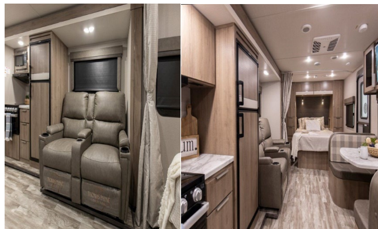
Grand Design Imagine XLS travel trailer 22MLE: