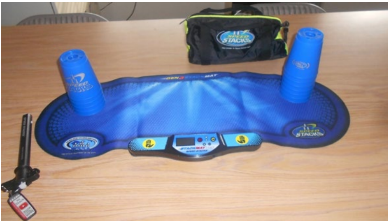
Official Speed Stacking Cups with G5 Timer, Mat and 12 Blue Cups $15 Text 253-221-1215