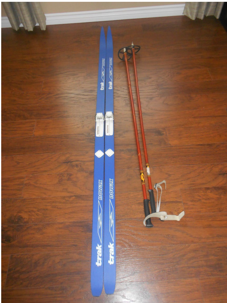
Nowax Trak 195cm Cross Country Skis W/ Exel Polaris 140cm Poles $50 Text 253-221-1215