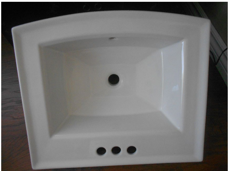
Brand New Kohler Archer White Drop-In Rectangular Traditional Bathroom Sink (22.625 in. x 19.4375 in.) $150 Text 253-221-1215