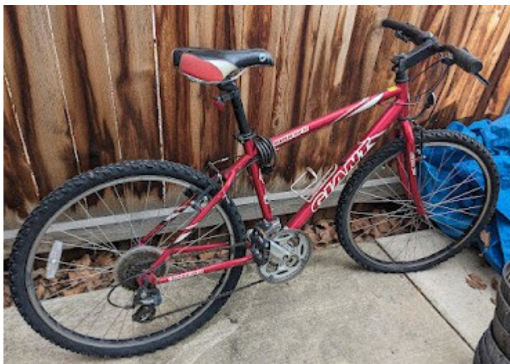
10 Speed Bike $30 OBO – Not used for several years. Call or Text 509-492-6622