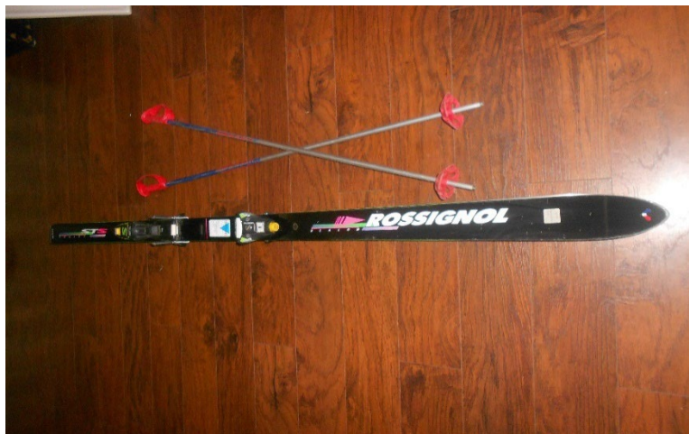
Rossignol Slalom Junior STS Equipe 157 Skis $75 Text 253-221-1215