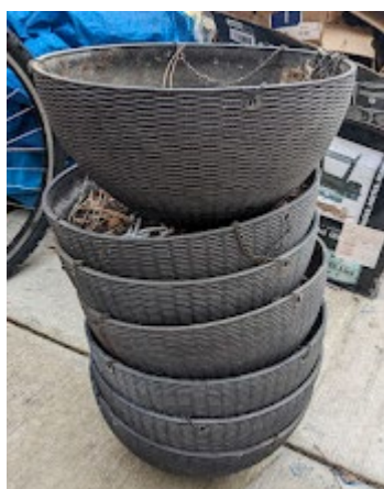
7 Hanging Pots $10 Call or Text 509-492-6622