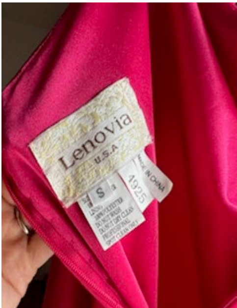
Prom Dress $40 Text 509-205-4794