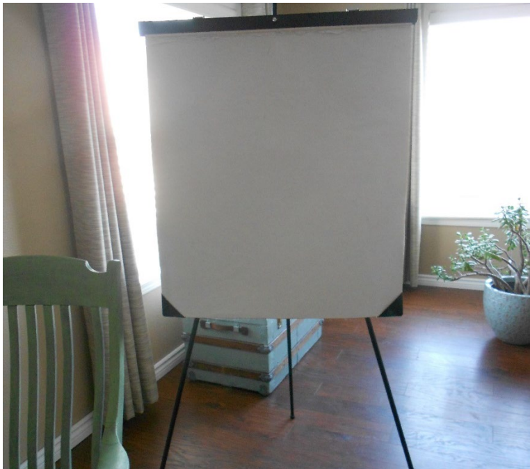
Lightweight easel with adjustable 3/4 aluminum tubular legs that securely twist-lock. Fully adjustable height extend for floor display or downsize to 34 tabletop display. No-pinch pad retainer makes one-handed operation effortless. Holds easel pad as large as 27 x 34 or only a single sheet. Conveniently downsize for storage and transport.