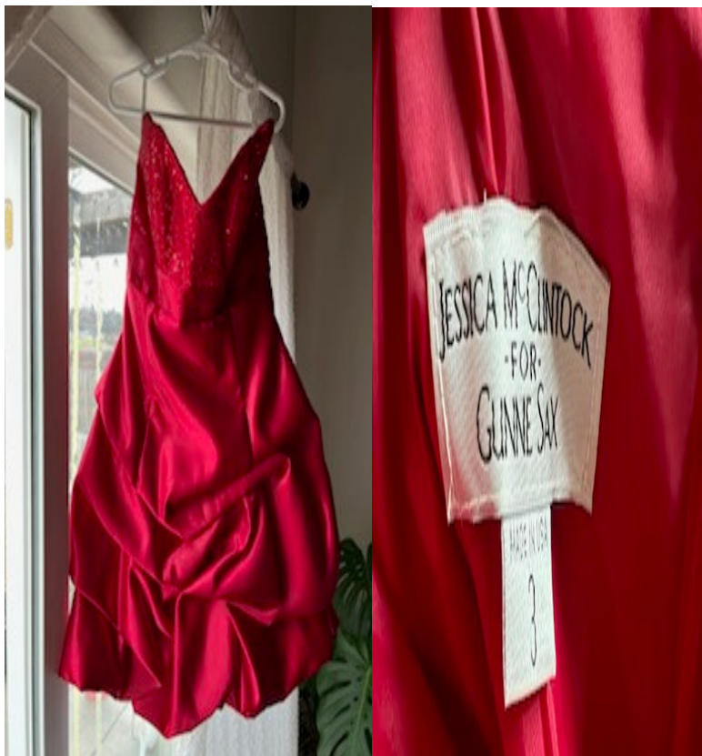
Prom Dress $40 Text 509-205-4794