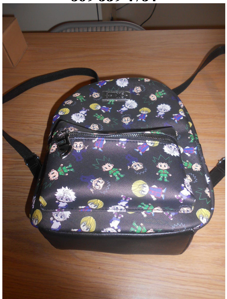
Hunter X Hunter Chibi Characters Mini Backpack Brand New $50