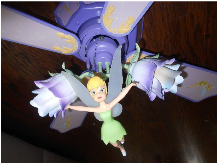
3 Speed Tinker Bell Ceiling Fan with Reversible Flow $125 Text 253-221-1215