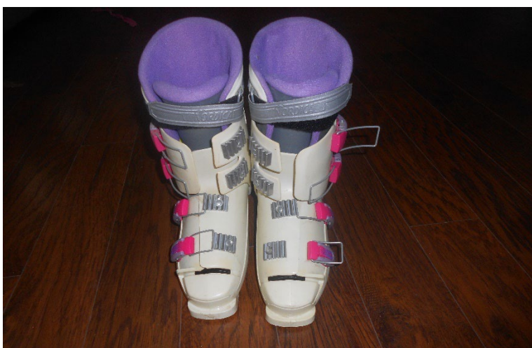
Nordica Front Entry Line V25 Ski Boots Ladies SZ 7 $50 Text 253-221-1215