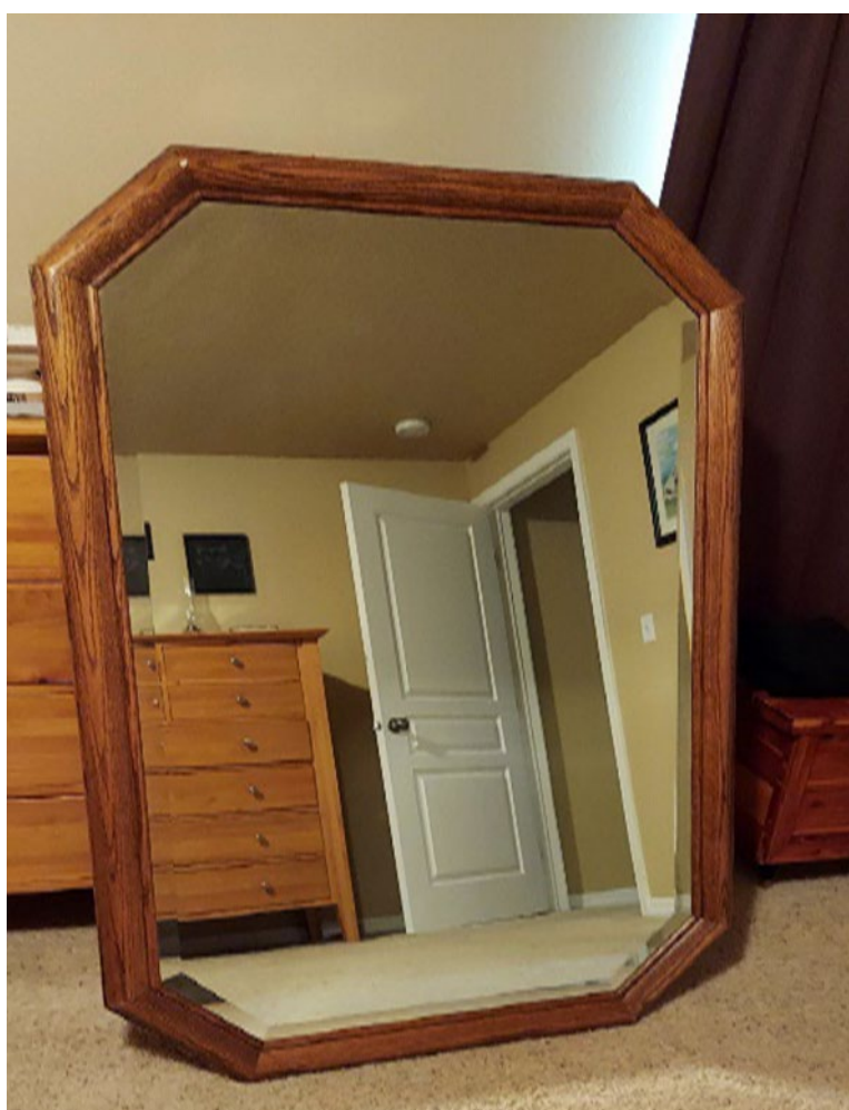
Oak Beveled Mirror Comes with European Secure Mounting Bracket. Measures 35"x55" $100 OBO TEXT: 509-551-5058