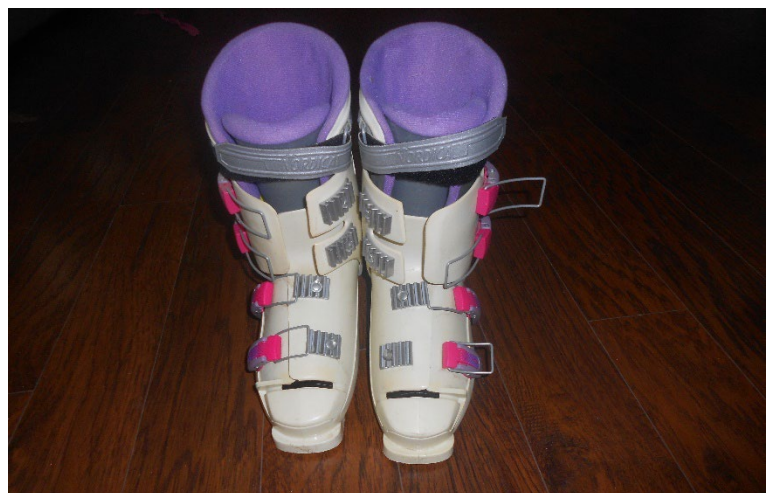
$50 - Nordica Front Entry Line V25 Ski Boots Ladies SZ 7 Text 253-221-1215