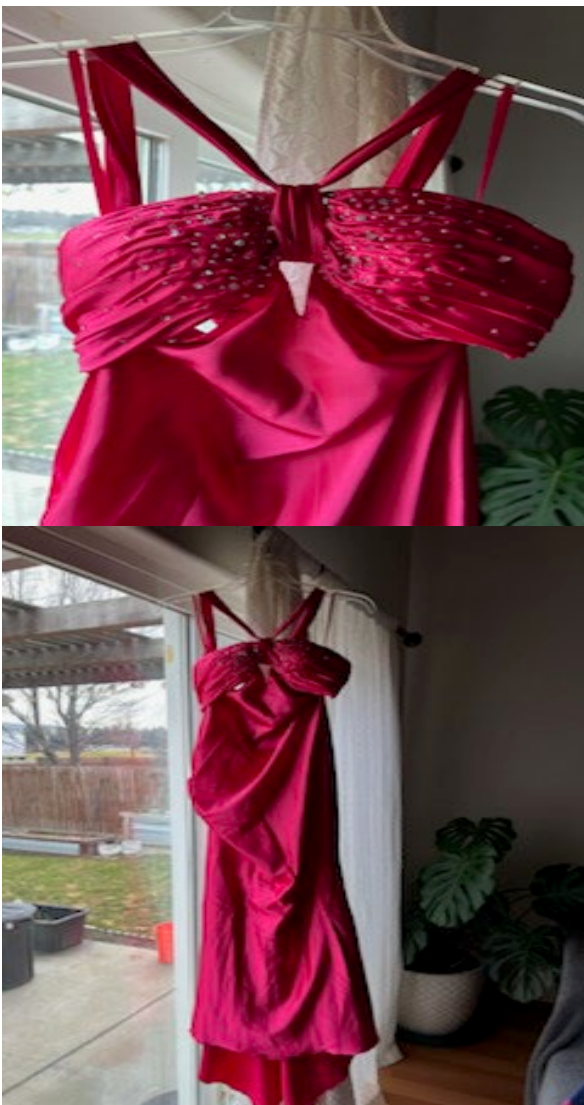
$40 - Prom Dress Text 509-205-4794