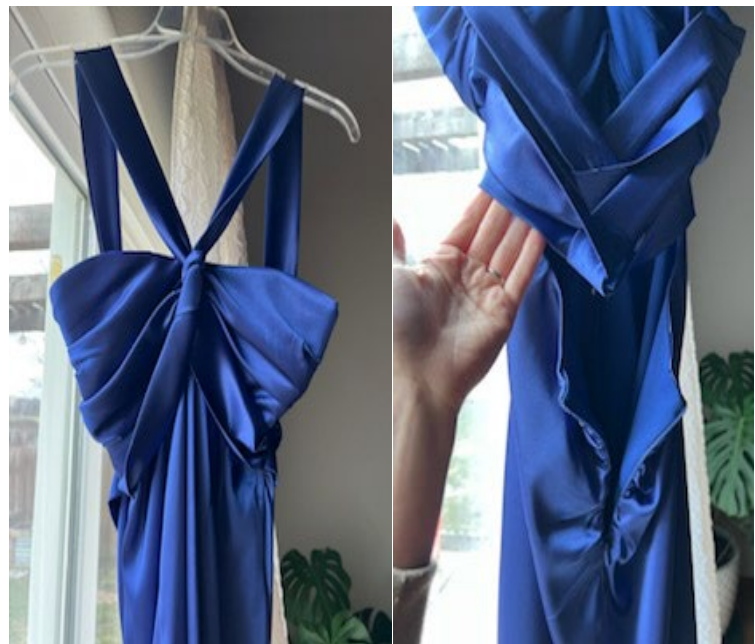
$40 - Prom Dress Text 509-205-4794