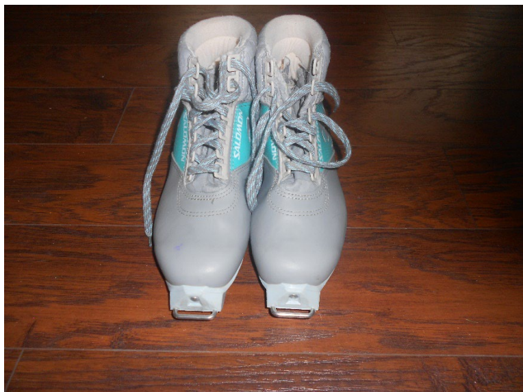
$25 - Salomon SR 301 Nordic Cross Country Ski Boots Size EU 40 (Ladies Sz 7) Text 253-221-1215