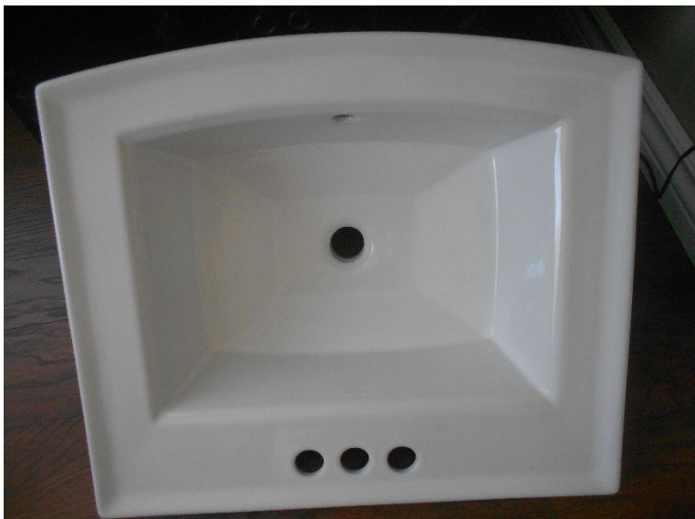
$150 - Brand New Kohler Archer White Drop-In Rectangular Traditional Bathroom Sink (22.625 in. x 19.4375 in.) Text 253-221-1215