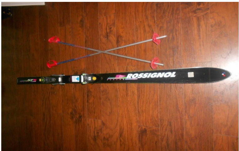
$75 - Rossignol Slalom Junior STS Equipe 157 Skis. Text 253-221-1215