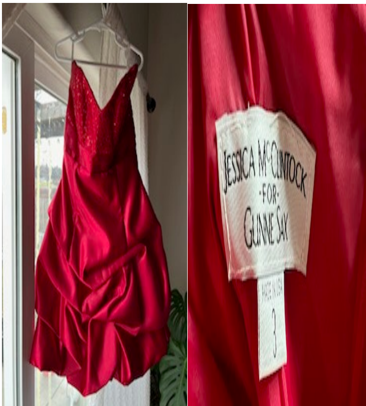
$40 - Prom Dress Text 509-205-4794