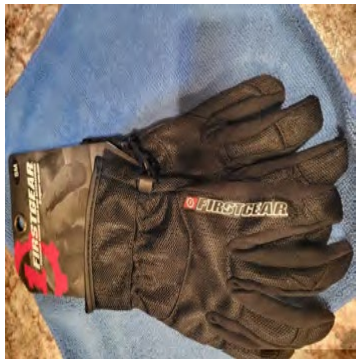
First Gear Premium Women's Gloves Size Small (Paid $30 selling for $15) 509-366-8449