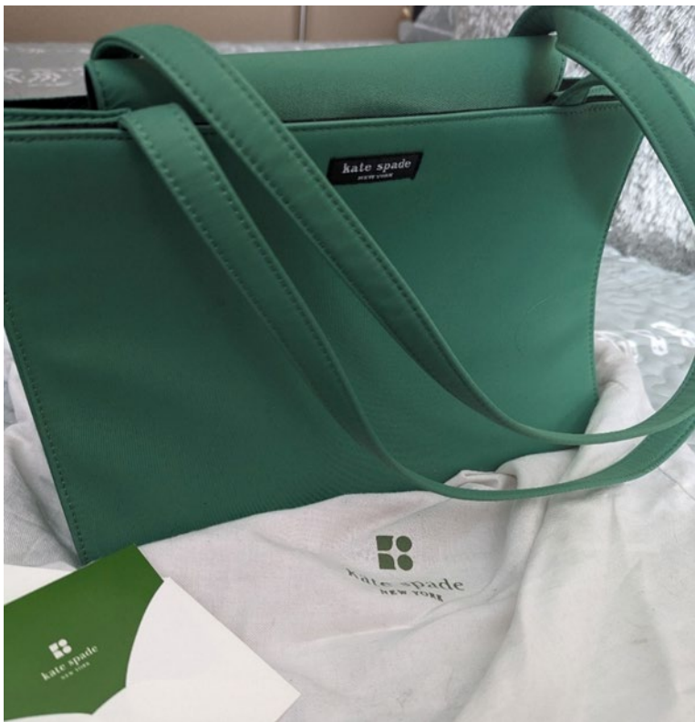
$100 Kate Spade Vintage Purse Brand New, Never Used Text 509-676-6574