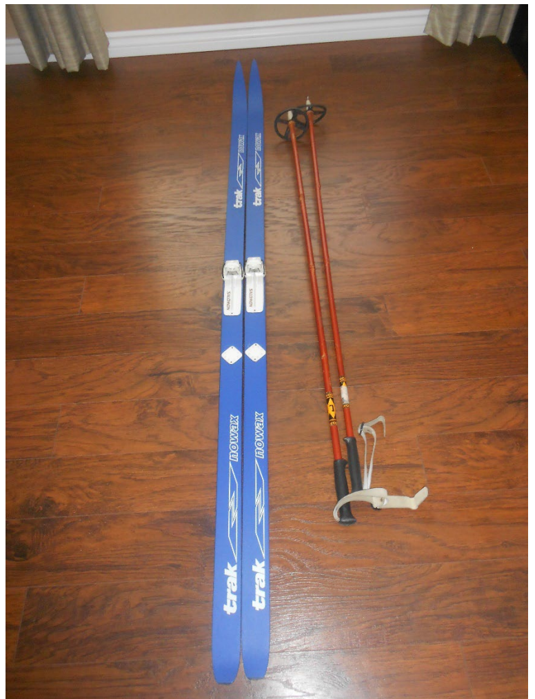
$50 - Nowax Trak 195cm Cross Country Skis W/ Exel Polaris 140cm Poles Text 253-221-1215