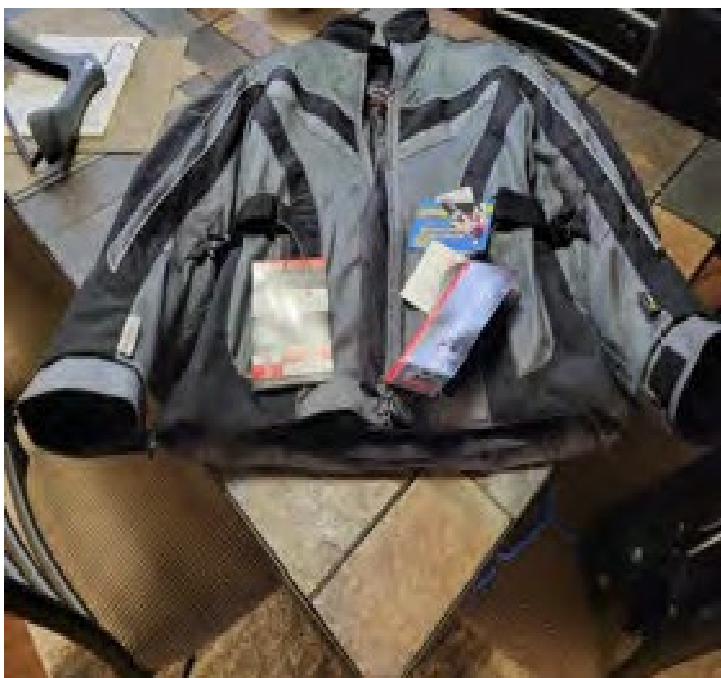
Olympia Moto Sports – Multi Season, Multi Function Thermolite Women's Large Jacket. Hard protection in elbow and shoulder area (paid $400, will sell for $200) Contact 509-366-8449