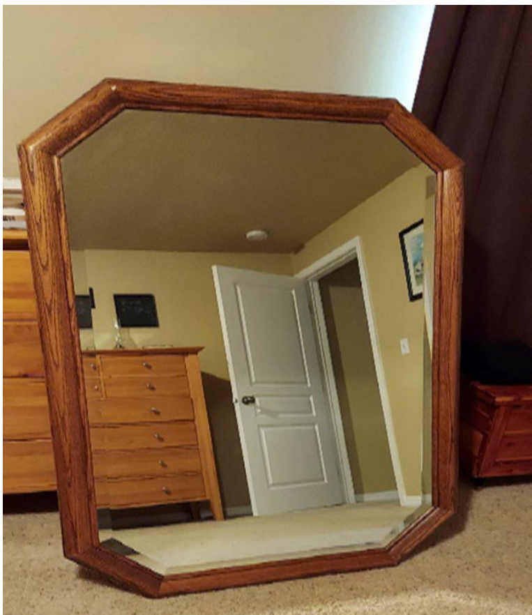
$100 OBO - Oak Beveled Mirror Comes with European Secure Mounting Bracket. Measures 35"x55" TEXT: 509-551-5058