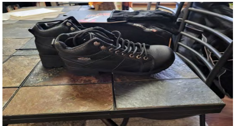
Harley Davidson Women's Black Boots Size 8 (paid $80, selling for $40) 509-366-8449