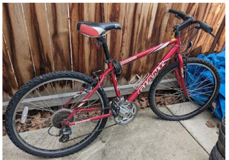
$30 OBO - 10 Speed Bike – Not used for several years. Call or Text 509-492-6622