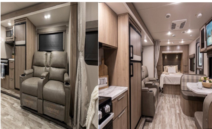
Grand Design Imagine XLS travel trailer 22MLE: