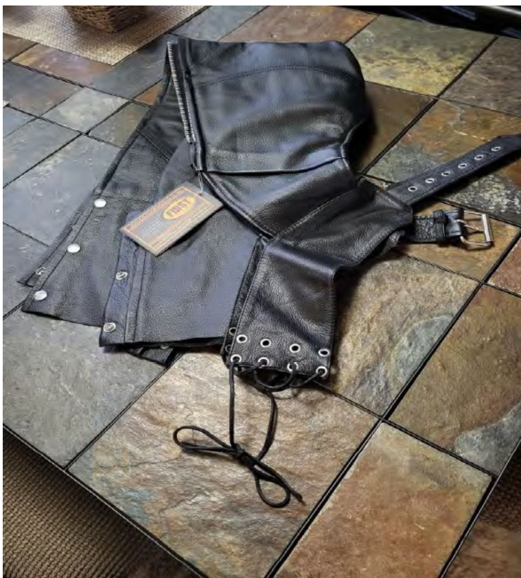
First Choice Leather Women's Chaps Size Large (paid $160 selling for $80) Contact 509-366-8449