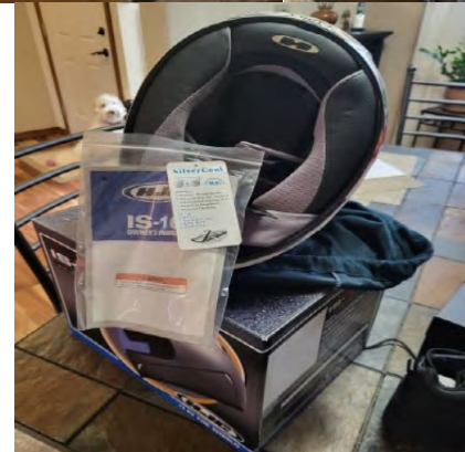
Harley Davidson Women's HJC Helmet IS- 16 (paid $300, will sell for $125) Contact 509-366-8449