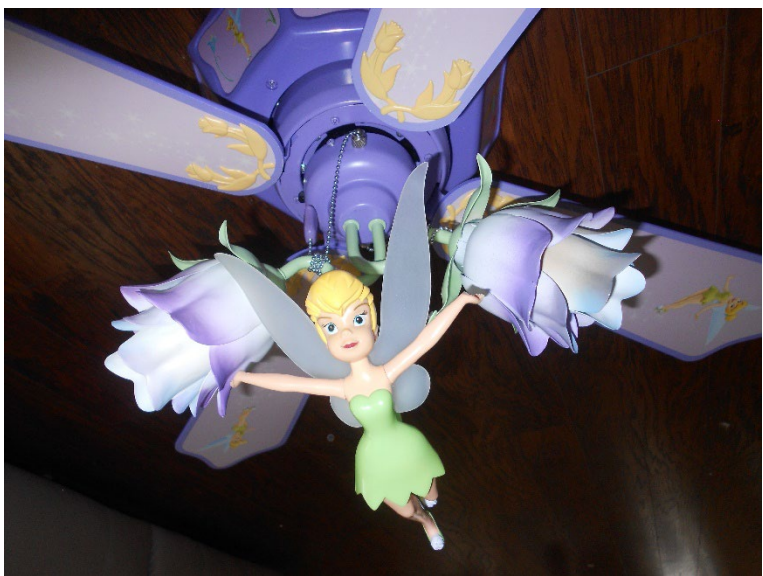
$125 - 3 Speed Tinker Bell Ceiling Fan with Reversible Flow Text 253-221-1215